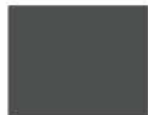
LC-2285 Dark Gray