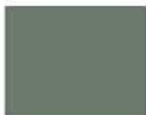
LC-2380 Willow Green